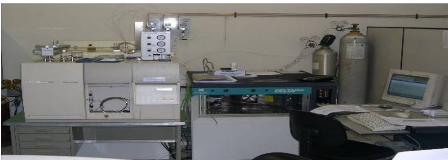
Fig. 02 – Mass Spectrometer

The \delta^{13}\text{C}-\text{CH}_4 was determined in a Carlo Erba NA 1600 elemental analyzer equipped with a Finnigan MAT ConFlo interface at the Laboratory of Marine Science (University of North Carolina) (Fig 02).