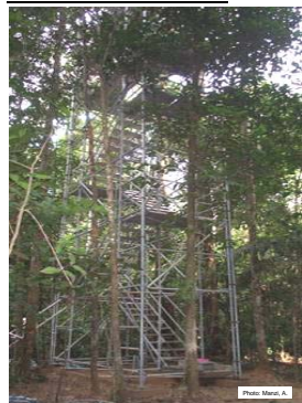
Fig. 01 – Tower site (km67) and sampling approach